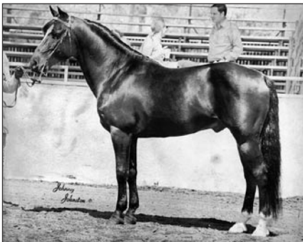
Farceur Morgan 1966